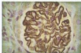
p35-null mice exhibit normal glomerular and podocyte differentiation. The cover shows a representative image of wild-type cells showing staining for nephrin. Image enhancement by MaryLou Quillen. See the article by Brinkkoetter et al., page 690