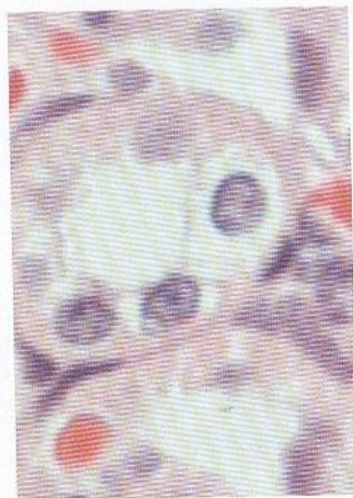
See page 681