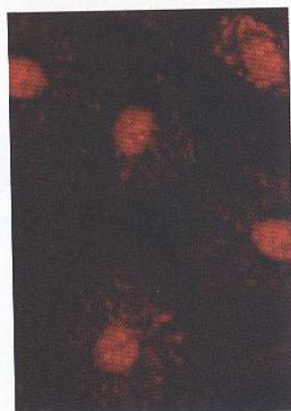
See page 690